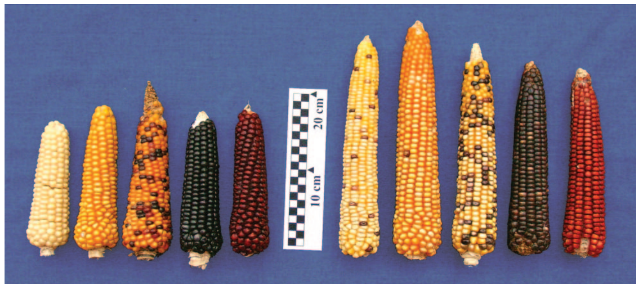
Fig. 2. The two most common maize races of the Maya highlands are Olotón (Left) and Comiteco (Right).

in Chamula and half of those in Oxchuc reported being self-sufficient in the grain. A small but apparently regular amount of seed is acquired from off-farm sources in each municipality.